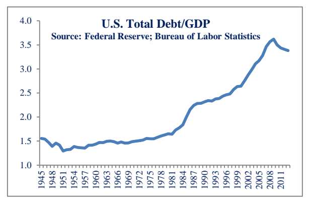
chart shows, but overall debt levels remain at historically very high levels. In short, this does still not look like an economy that is set up to withstand high interest rates. Therefore, we believe that rate rises will remain moderate either through the Fed's cautious approach or through an overly aggressive series of hikes being halted by an adverse GDP response to an onerous cost of financing. Low rates, and low real rates continue to be in our national interest.

Although the 2008 financial crisis was fundamentally about too much debt, total U.S. debt as measured by the Fed's Flow of Funds report continued to rise, reaching over $56 trillion in 2013 (as a percentage of GDP it has moderated somewhat). This is private and public sector debt. As the household sector reduced leverage after 2008, the public sector increased its bond holdings, most notably through the Federal Reserve's program of Quantitative Easing which grew its balance to $4.4 trillion before it stopped buying last October (however, it's still growing through reinvestment of interest income). Total Debt/GDP has moderated somewhat as the