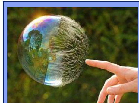
Analyzing Social Media Stocks